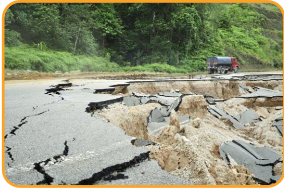
DISASTER PREPAREDNESS & RELIEF

Through education, environment, and other philanthropic efforts, we carry out our pledge to make the world a better place. We strive to set examples for those we work with, for, and around with high standards of corporate citizenship.